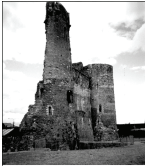
The ruins of Ferns Castle

For three and a half years, Edward de Bruce tried to make his new kingdom in Ireland a reality and bring England's control to an end. Then he was killed in the battle at Fochart, just north of Dundalk, in October 1318. Edward's conquest suffered from poor timing due to one of the worst famines to afflict Europe in the later middle ages. Edward's